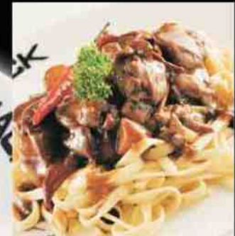
#079 $9.90 Spaghetti with Spicy Kung Pao Chicken