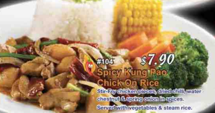
#104 Spicy Kung Pao Chick On Rice Stir-Fry chicken pieces, dried chilli, water chestnut & spring onion in spices. Served with vegetables & steam rice.