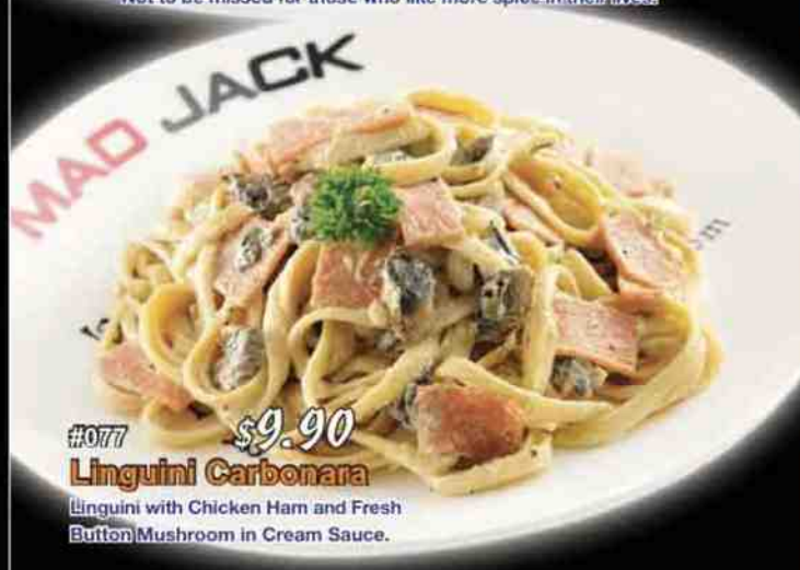
#077 $9.90 Linguini Carbonara Linguini with Chicken Ham and Fresh Button Mushroom in Cream Sauce.