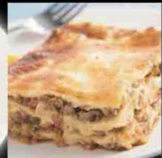
#080 $9.90 Beef Lasagne Served with apple peach salad. Groovy & cheesy lasagne with layers of pasta, cheese & beef mince.