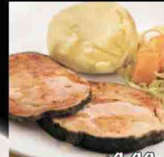
#093 Mock Fish In Honey Lemon Sauce Served with mashed potato & apple peach salad.