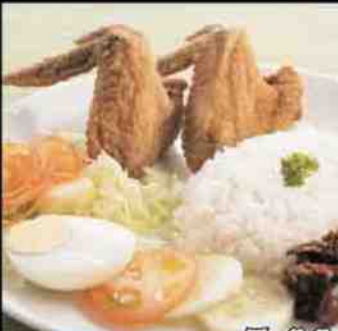
#101 MAD Wing Nasi Lemak Crispy & juicy MAD wings. Served with egg, chili & apple peach salad.