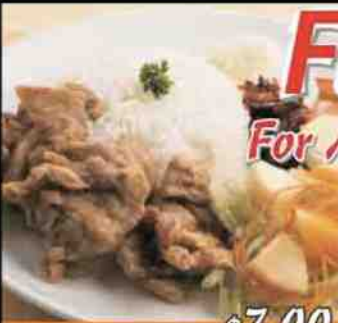
#103 Psycho Chick Nasi Lemak Tasty & crispy boneless chicken pieces. Served with egg, chili & apple peach salad.