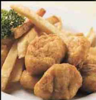
#035 Chicken Nuggets & Chips 6 pieces of chicken nuggets & chips. $7.90