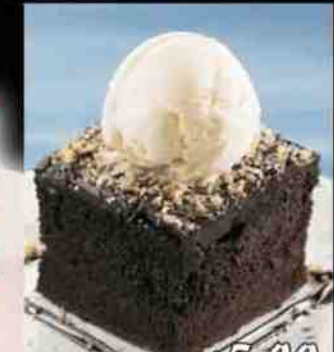
#218 $5.90 CRAZY Choc Nut Cake with Ice Cream & Choc Topping

Richest Choc Cake & choc sauce. Warning for Choc Die-hard: Don't go home without this.