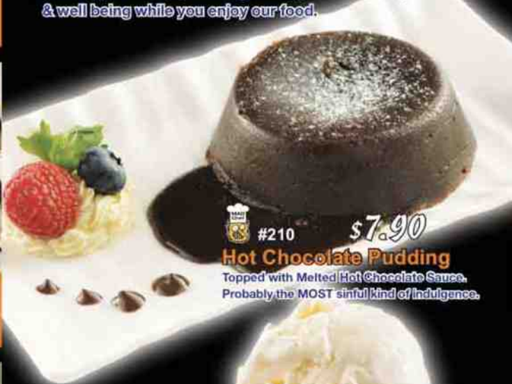
#210 $7.90 Hot Chocolate Pudding Topped with Melted Hot Chocolate Sauce. Probably the MOST sinful kind of Indulgence.