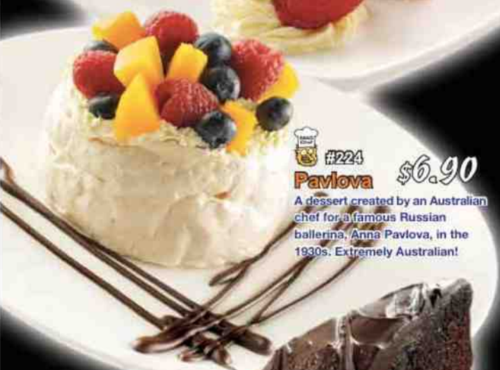
#224 $6.90 Pavlova

Very popular Australian tea snack. Light sponge coated with raspberry jelly and finished off with desiccated coconut.