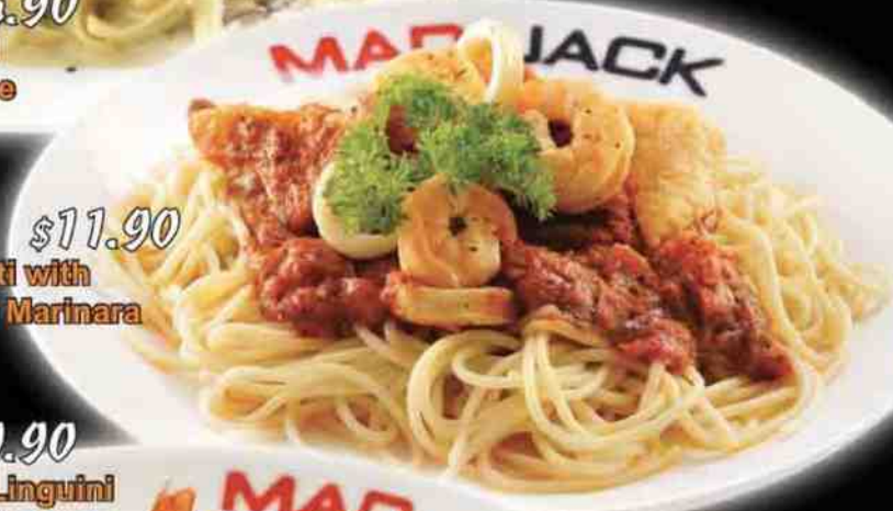
#075 $11.90 Spaghetti with Seafood Marinara