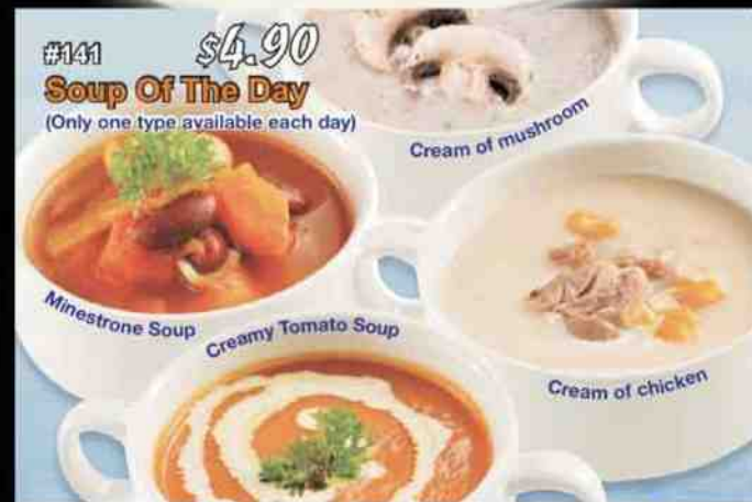
#141 $4.90 Soup Of The Day (Only one type available each day)