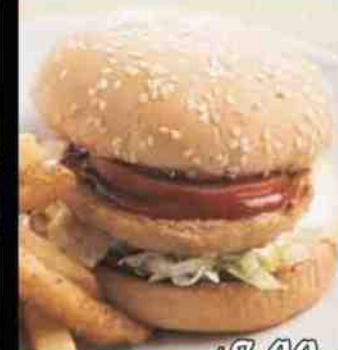
#094 Mock Chicken Burger & Chips