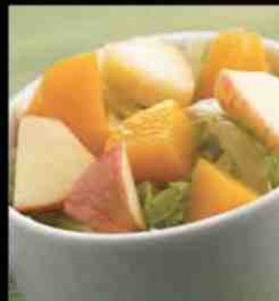
#143 $3.90 Apple Peach Salad Fresh golden salad served with peach & fresh apple.