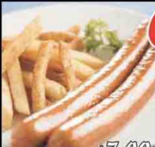
#034 9" Sausages & Chips 9" chicken sausages for nice & tasty bites. $7.90

Monday - Friday $1.99 extra - $2.99 extra * ADD $3.50 for Soup Of The Day (Save $1.40) #181 * ADD $3.50 for Dessert Of The Day (Save $1.40) #182 Monday - Sunday Whole Day * ADD $9.00 for Pepsi, Soup & Dessert Of The Day (Save $3.30) #183 * ADD $6.00 for Seafood Roll (Save $1.50) #184