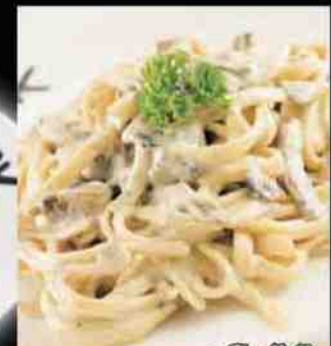
#078 $8.90 Vegetarian Linguini in Cream Sauce