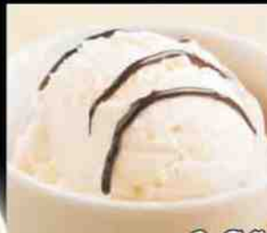
#214 $2.80 Vanilla Ice Cream with Choc Topping