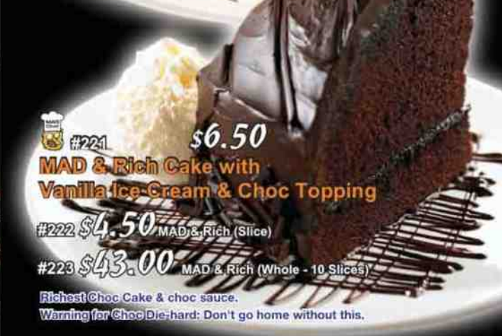
#221 $6.50 MAD & Rich Cake with Vanilla Ice-Cream & Choc Topping

A dessert created by an Australian chef for a famous Russian ballerina, Anna Pavlova, in the 1930s. Extremely Australian!