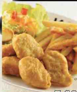
#191 $7.90 Chicken Nuggets & Chips