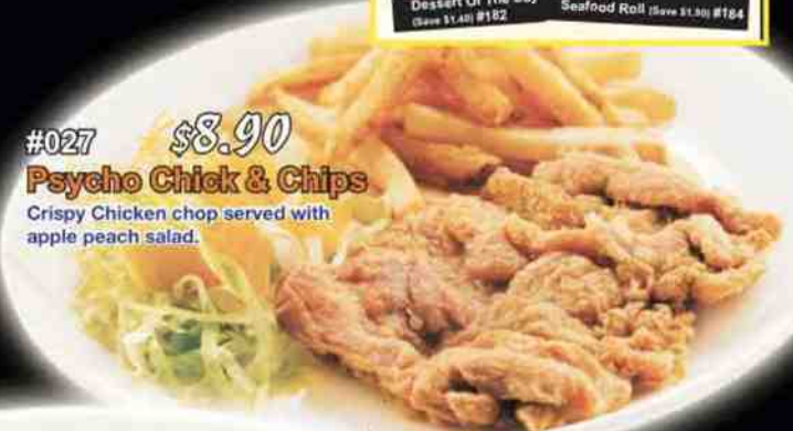
#027 Psycho Chick & Chips Crispy Chicken chop served with apple peach salad. $8.90