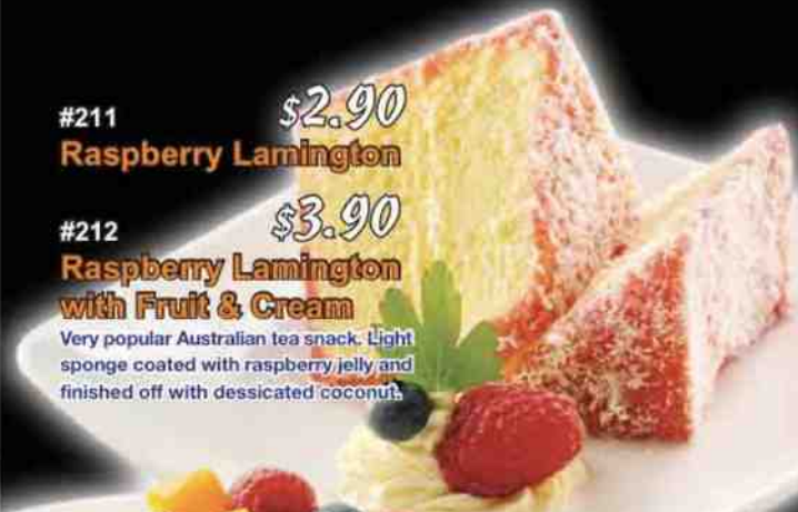
#211 $2.90 Raspberry Lamington

Super rich choc walnut brownie. Absolutely to die for.