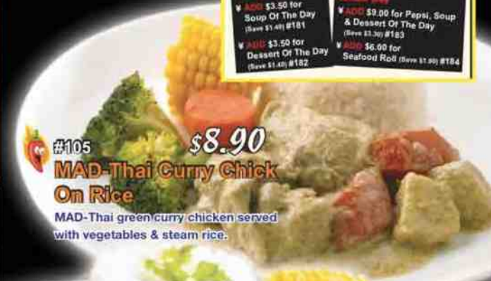
#105 MAD-Thai Curry Chick On Rice MAD-Thai green curry chicken served with vegetables & steam rice.