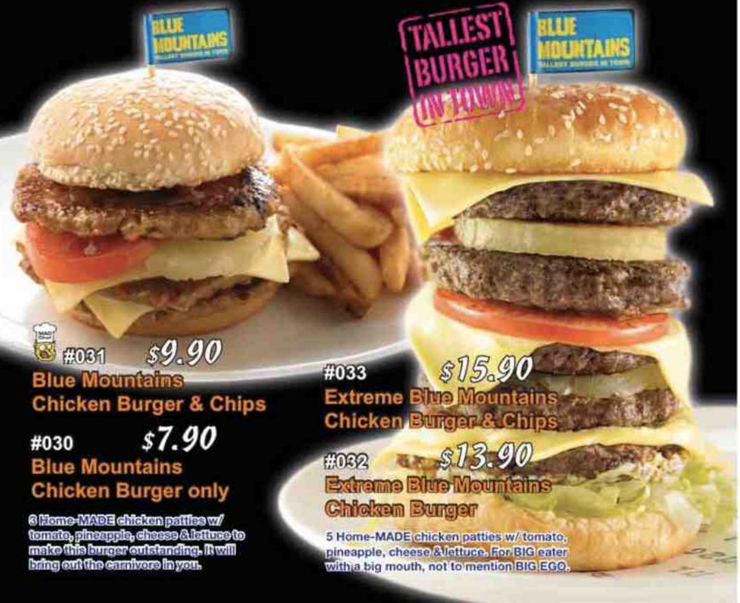
#031 Blue Mountains Chicken Burger & Chips $9.90