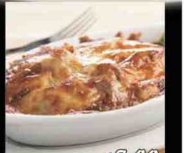
#025 Chicken Baked Rice Grilled chicken pieces & mushroom rice topped with cheese and baked till golden brown to make this a perfect treat for cheese lovers. However, we need at least 20 minutes because it is freshly baked on-the-spot. $8.90