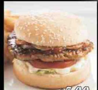
#029 Chicken Burger & Chips $5.90