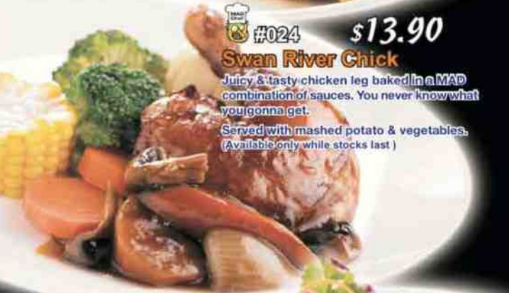
#024 Swan River Chick Juicy & tasty chicken leg baked in a MAD combination of sauces. You never know what you gonna get. Served with mashed potato & vegetables. (Available only while stocks last) $13.90