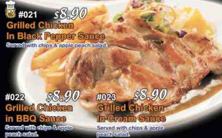
#021 Grilled Chicken In Black Pepper Sauce Served with chips & apple peach salad. $8.90