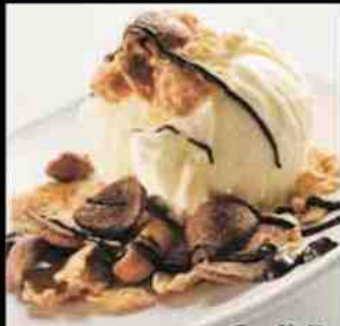
#213 $3.90 Ice Cream with Cereal An awesome surprise for most first timers. Guaranteed NO REGRETS with bits of crunch & creamy flavor.

We insist on fresh & natural 5 STAR quality ingredients for our desserts & cakes. We make them fresh everyday On-The-Spot with NO COMPROMISE ON TASTE . NO artificial flavoring, NO coloring & NO preservatives. Only fresh dairy cream, butter & milk from Australia/UK & top grade chocolate are used. They simply taste better & healthier in many awesome ways. Most important of all, we are genuinely interested in your health & well being while you enjoy our food.