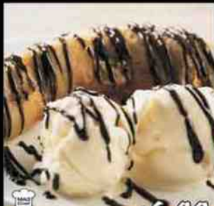
#201 $6.90 Banana Craze Freshly fried Del-Monte banana fritter with vanilla ice cream and rich choc sauce.