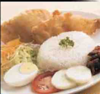
#102 Fish Nasi Lemak Crispy battered. Fresh, juicy & chunky fish fillet in Aussie style. Served with egg, chili & apple peach salad.