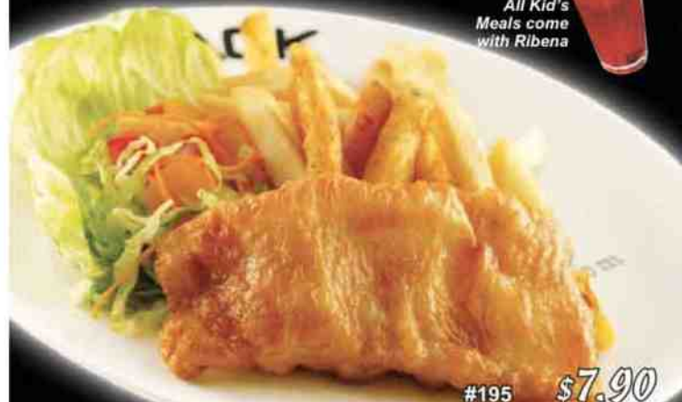
#195 $7.90 Fish & Chips