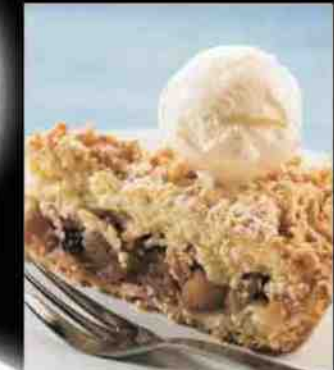
Country style apple pie made of MJ's signature pastry. $5.90