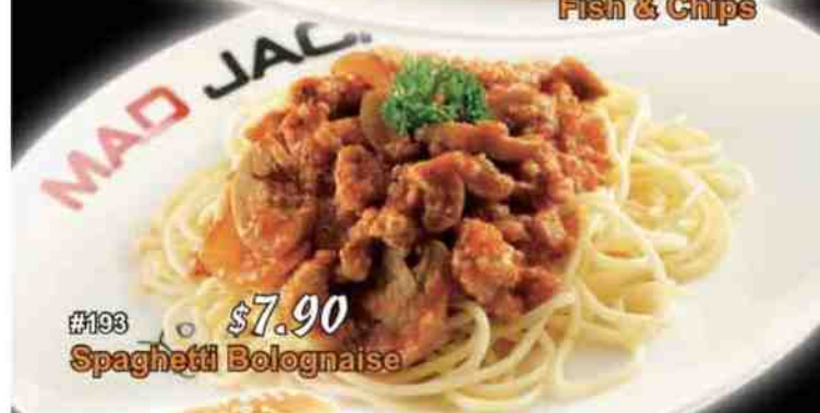
#193 $7.90 Spaghetti Bolognese