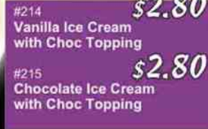
#215 $2.80 Chocolate Ice Cream with Choc Topping