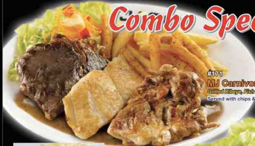
#171 $21.90 MJ Carnivore Combo Grilled Ribeye, Fish & Chicken Served with chips & apple peach salad.