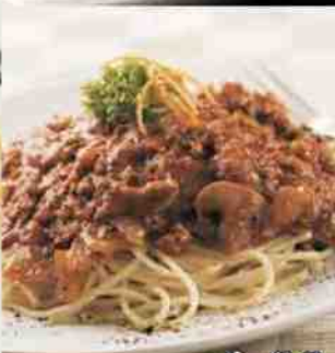
#071 $6.90 Spaghetti with Chicken Bolognese Sauce Spaghetti with specially cooked chicken bolognese sauce in Home-Made style.