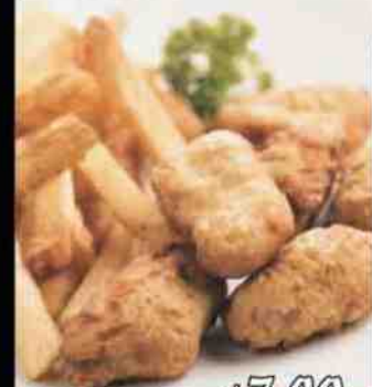
#095 Mock Chicken Nuggets & Chips