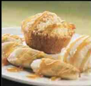
#205 $5.90 WILD BOY Banana Crumble with Fresh Banana, Vanilla Ice Cream & Caramel topping