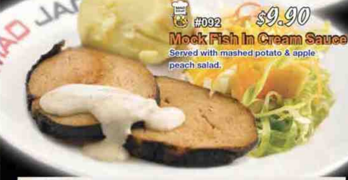
#092 Mock Fish In Cream Sauce Served with mashed potato & apple peach salad.