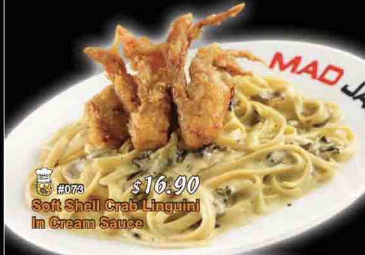
#073 $16.90 Soft Shell Crab Linguini In Cream Sauce