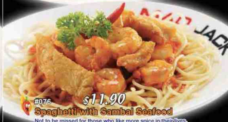
#076 $11.90 Spaghetti with Sambal Seafood Not to be missed for those who like more spice in their lives.