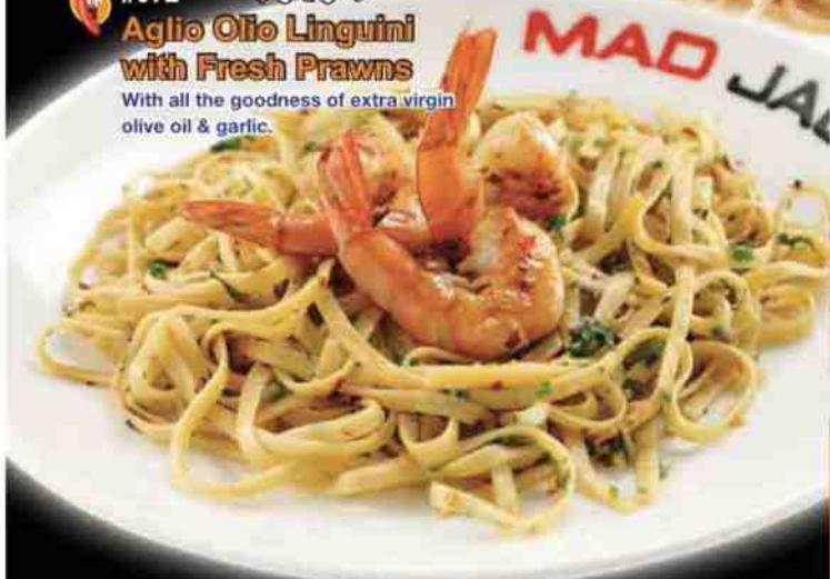
#072 $9.90 Aglio Olio Linguini with Fresh Prawns With all the goodness of extra virgin olive oil & garlic.