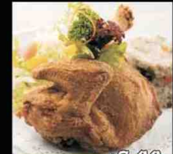
#026 Crazy Chick & Chips $8.90