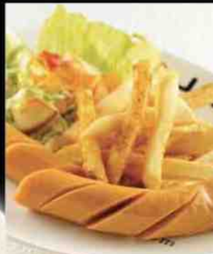
#194 $7.90 Sausages & Chips