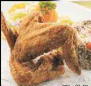
#036 MAD Wings & Chips Served with apple peach salad. $7.90