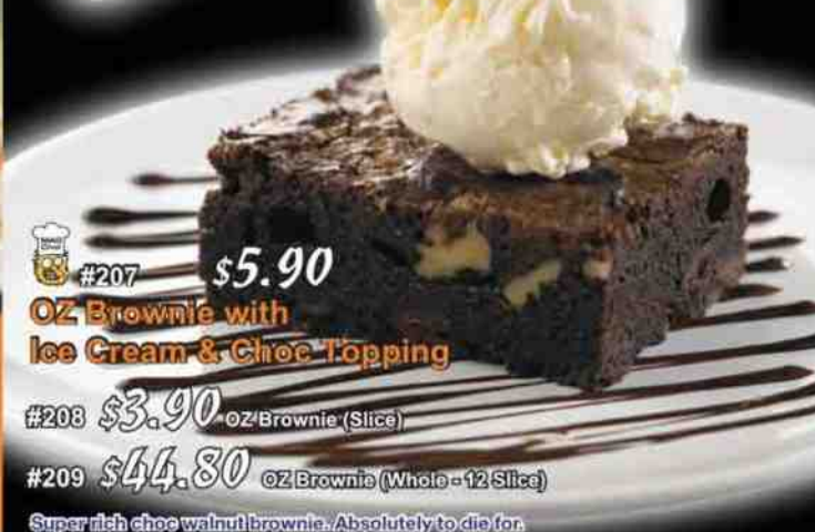
#207 $5.90 OZ Brownie with Ice Cream & Choc Topping