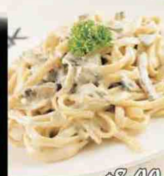
#078 Vegetarian Linguini In Cream Sauce