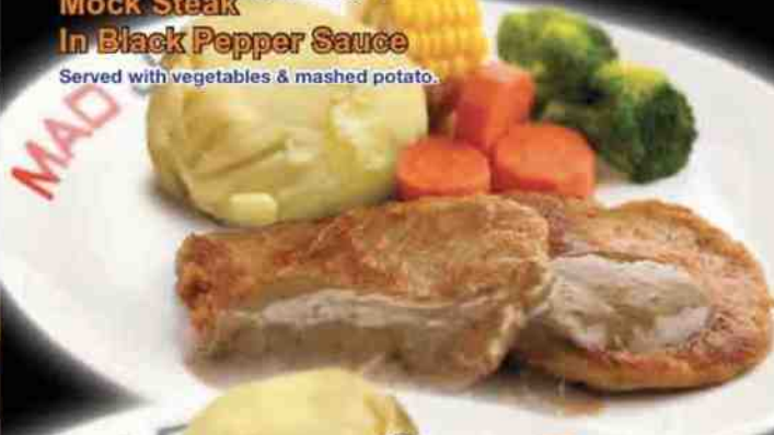
Mock Steak In Black Pepper Sauce Served with vegetables & mashed potato.