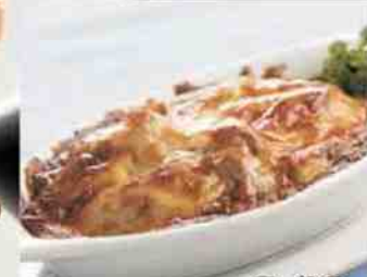
#096 Vegetarian Baked Rice Vegetables & mushroom rice topped with cheese and baked till golden brown to make this a perfect treat for cheese lovers. However, we need at least 20 minutes because it is freshly baked on-the-spot.