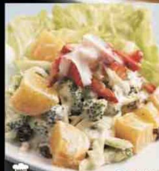
#142 $5.90 Broccoli Strawberry Salad Broccoli salad topped with yoghurt & fresh strawberry.