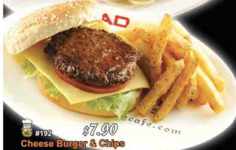
#192 $7.90 Cheese Burger & Chips